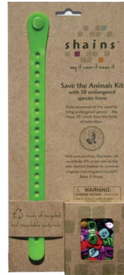
12 Bracelet Colors to Choose From