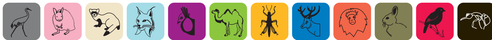
*Not actual size; species may appear on different color than shown.